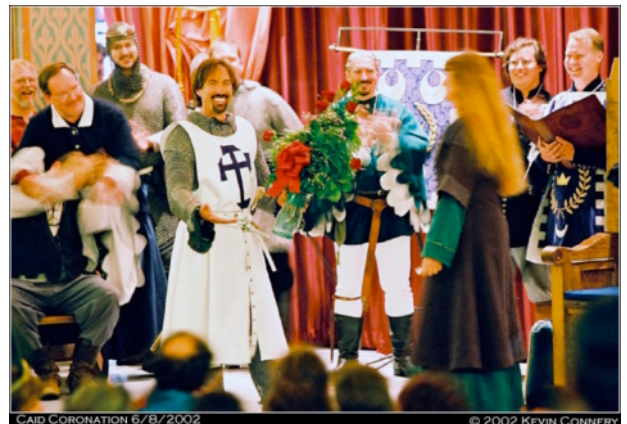
CAID CORONATION 6/B/2002

Each kingdom has figureheads in the form of a King and Queen, who are selected in a tournament or arms. These individuals run the kingdom with the support of a staff of volunteers called “kingdom officers”, and follow the guidelines set out in the Kingdom Laws, which in turn are governed by the policies of the Board of Directors of the SCA, Inc., and modern law. (A copy of the Corpora is available on line at www.sca.org if you are interested in further information regarding our structure and regulations.)