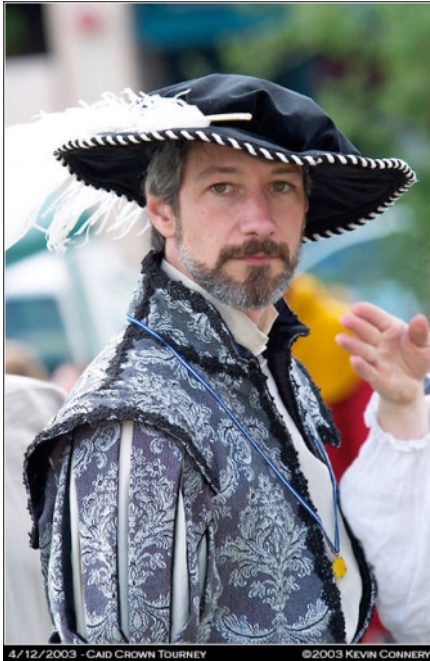
4/12/2003 - CAID CROWN TOURNEY

Our events generally contain elements of period traditions, pared down in time and scale, to occupy a day, weekend, and on a few occasions week-long (or even longer) gatherings. We attempt to locate sites that can accommodate as many of our needs as possible, including